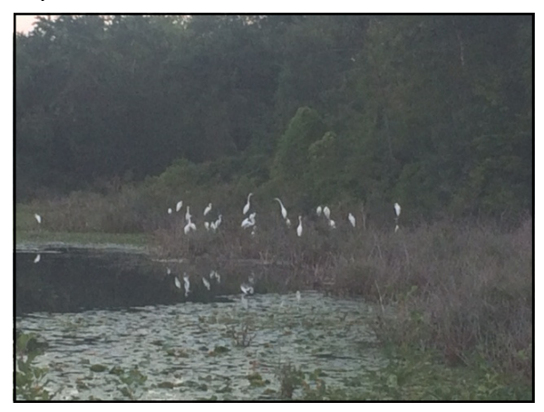
Our friends, The Egrets, on Clam Lake at Canterbury-on-the-Lake

Every night at Canterbury we have a gathering of Great Egrets. They fly into Clam Lake between 7:30 and 8:30 in the evening and spend the night. Residents told us they have done this for a few years. They start to arrive in August and the numbers increase as they prepare to migrate. We first noticed them when there were 12 to 14. The numbers have now increased to 52. It is beautiful to watch them fly in and land. You can recognize them with their white feather bodies and wings, long black legs, and long neck and yellow beaks. Come and join us at the transportation door or pavilion.