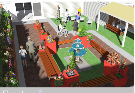
Anucroury Terrace Garden

We have desire to meet our fundraising goal of $200,000 to create this much-needed environment. Please help by joining us at the gala, making a cash donation or of an item to be auctioned off in the silent auction. Every little bit we do takes us closer to making Canterbury a better place to live for all!