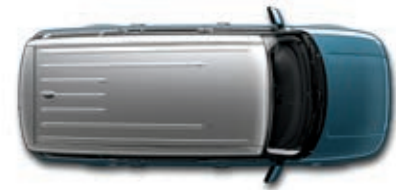
● Ingot Silver roof Too Good to Be Blue lower