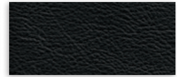
6 Charcoal Black Leather