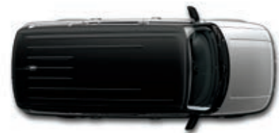
● Shadow Black roof Ingot Silver lower