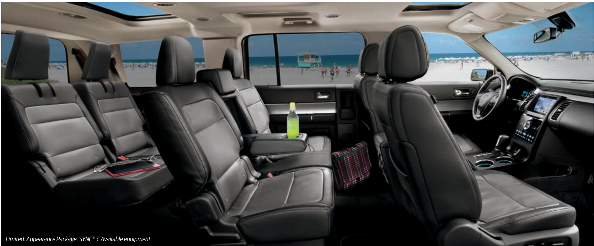
Limited. Appearance Package. SYNC®3. Available equipment.