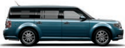
Too Good to Be Blue*