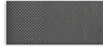
7 Dark Earth Gray Leather with Light Earth Gray Perforated Inserts