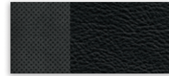
9 Charcoal Black Leather with Perforated Inserts