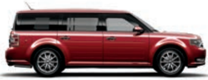
Ruby Red Metallic Tinted Clearcoat