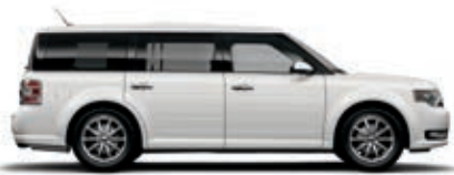
White Platinum Metallic Tri-coat