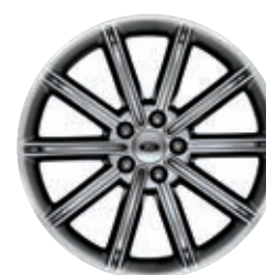
19" Premium Luster Nickel-Painted Aluminum Standard

High-intensity discharge (HID) headlamps.