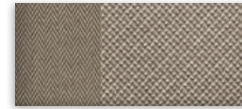
1 Dune Cloth