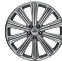
20" Bright-Painted Aluminum Available: SEL