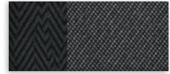
4 Charcoal Black Cloth