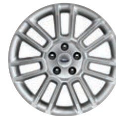
18" Sparkle Silver-Painted Aluminum Standard: SEL