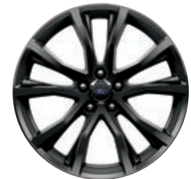
20" High-Gloss Black-Painted Aluminum Included: Appearance Package