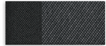
2 Charcoal Black Cloth