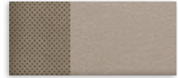
8 Dune Leather with Perforated Inserts