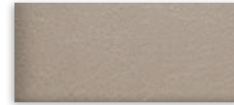
5 Dune Leather