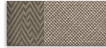
3 Dune Cloth