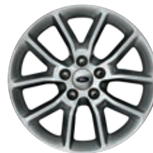
17" Sparkle Silver-Painted Aluminum Standard: SE

SEL. Fold-flat 2nd- and 3rd-row seats. 83.2-cu.-ft. cargo volume.