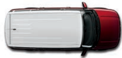
○ Oxford White roof Ruby Red Metallic Tinted Clearcoat lower