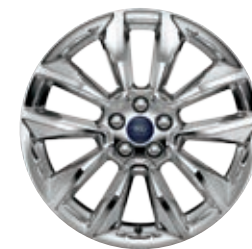
19" Chrome-Like Alloy Finish Included: Chrome Package on SE