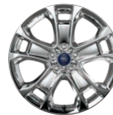
18" Chrome Alloy Finish Available: SE