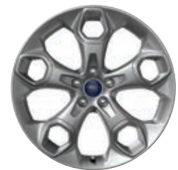
19" Premium Luster Nickel-Painted Aluminum Optional