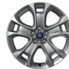
18" Sparkle Nickel-Painted Aluminum Standard

High-intensity discharge (HID) headlamps!*