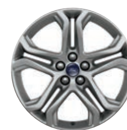
19" Premium Luster Nickel- Painted Aluminum Standard