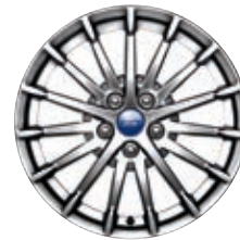
17" Sparkle Silver-Painted Aluminum Standard