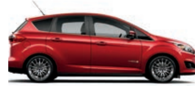
Ruby Red Metallic Tinted Clearcoat