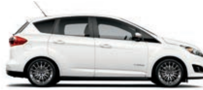
White Platinum Metallic Tri-coat